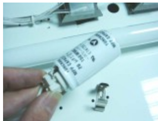
4: Remove capacitor