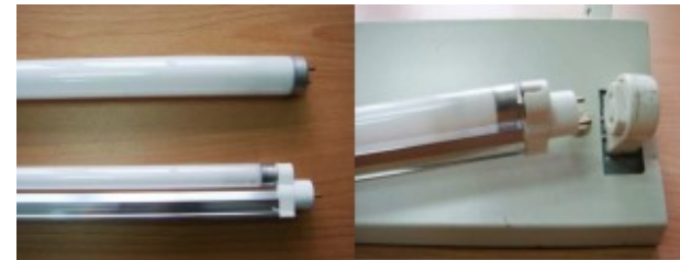
6: Fix T5 lighting fixture directly on T8 lantern