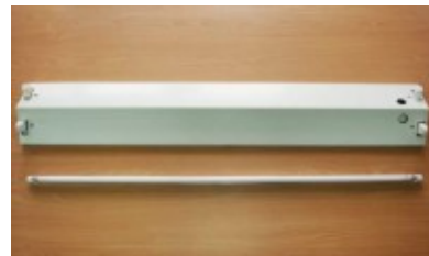
5: Fix the T8 lamp lantern