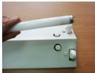
1: Remove T8 lamp tube