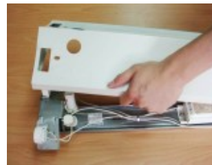
2: Remove T8 lamp lantern